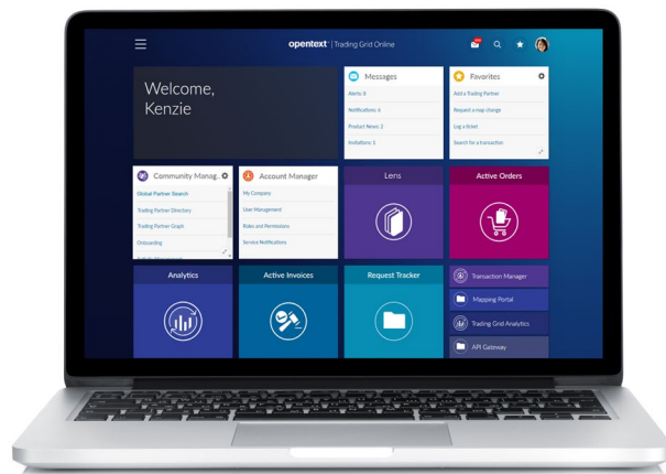
Trading Grid Online is the single sign-on portal for accessing all Trading Grid applications